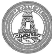
La Bonne Vie Camembert.