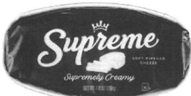
Supreme Oval, 7-ounce hunk.