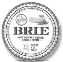
Aldi Emporium Selection Brie.