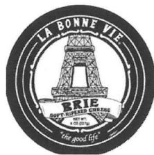
La Bonne Vie Brie.