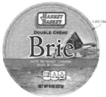
Market Basket Brie.