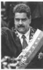
Venezuelan President Nicolas Maduro