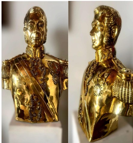
Exhibit D - Bust of General Don José de San Martín