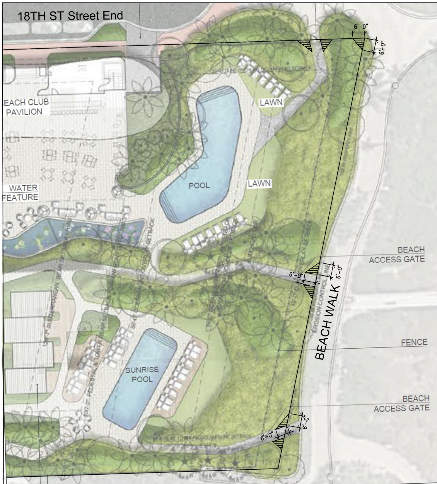
Proposed Line of sight 6' visibility triangle requirements for oceanfront properties

On all oceanfront properties, there shall be no structure or planting within a 6 foot visibility triangle from a street-end or upland property access point to the beach walk, which obstructs pedestrian visibility between a height of 2 feet and 10 feet above the adjacent grade. This 6-foot visibility triangle requirement shall be measured directionally from the intersection of the street-end, or public access point, as applicable, along the property line fronting the beach walk. Notwithstanding the foregoing, aluminum picket fences, with gaps of at least four (4) inches, may be permitted at a height exceeding 2 feet, subject to all applicable regulations set forth in the Land Development Regulations.