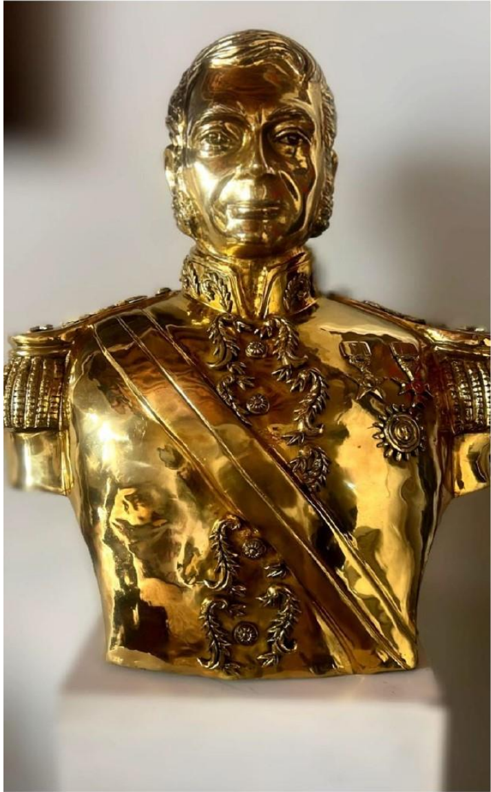
Exhibit D - Bust of General Don José de San Martín