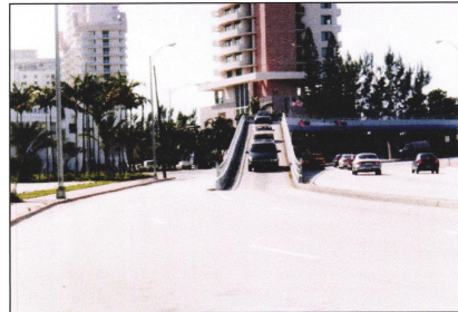
Figure 4. 63rd Street Flyover - At touchdown, looking south on Indian Creek Drive.