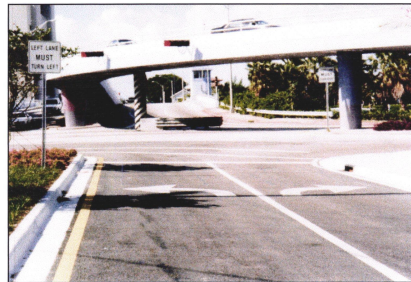
Figure 6. 63rd Street - Looking westbound at Indian Creek Drive intersection.