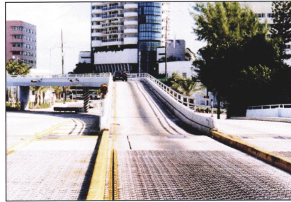
Figure 3. 63rd Street Flyover - Looking east from bascule bridge crossing.