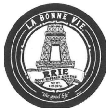
La Bonne Vie Brie.