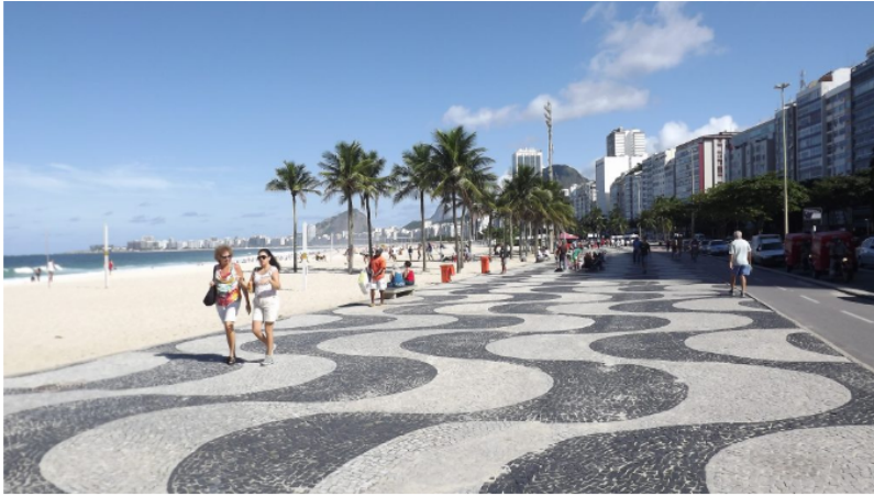
The undulating mosaic of the walkway at Rio's Copacabana beach is perhaps Burle Marx's most famous work.

Public Works researched mosaic walkways by Burle Marx, to get an idea of how these sidewalks looked (photo below). The closest sidewalk material to create the desired wave-like design is Stamped Specialty sidewalk, estimated at $1,693,500, plus an estimated 5% per year for maintenance, for a total estimated cost of $1,778,175 for the first year.