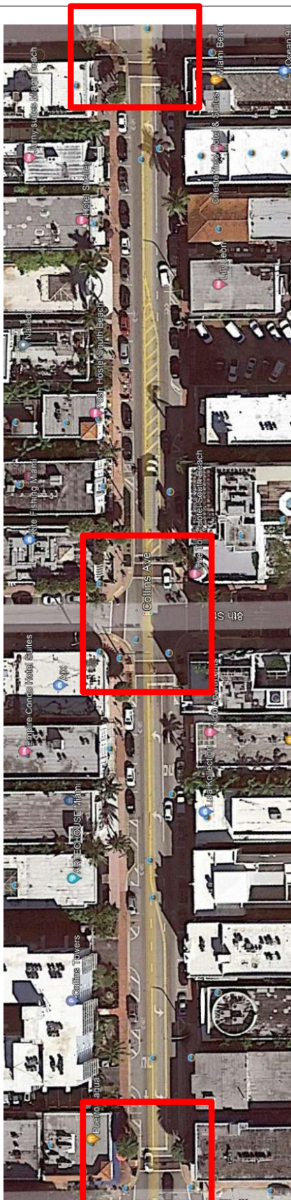
FROM 7 TH TO 9 TH STREET