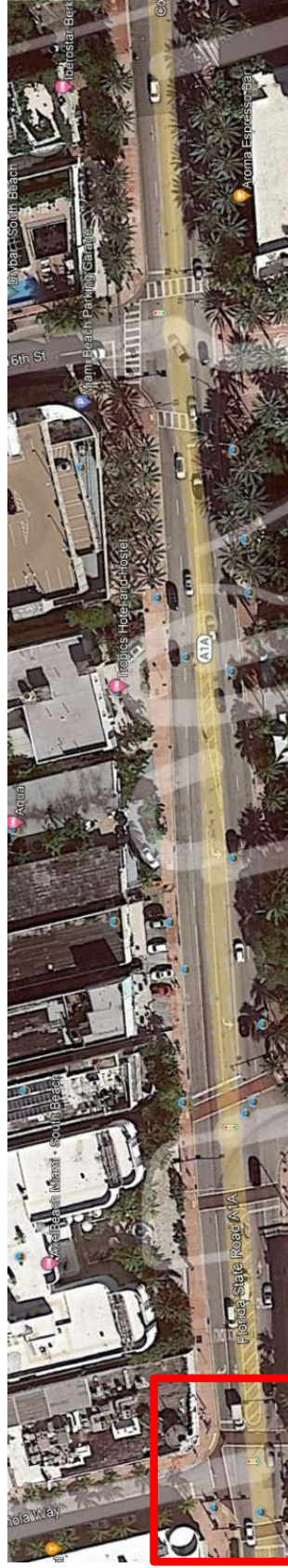
FROM ESPANOLA TO 16 TH STREET