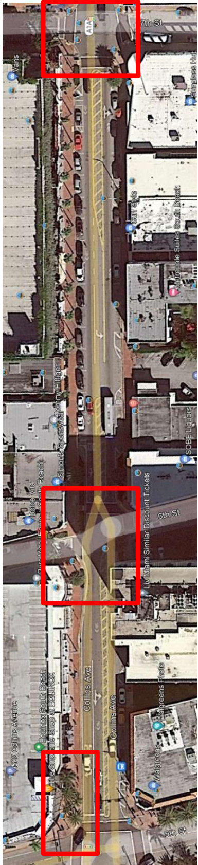
FROM 5 TH TO 7 TH STREET