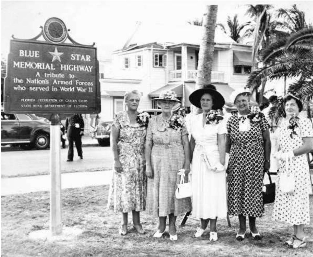
Picture of the Key West Garden Club Board Members and Florida Federation of Garden Clubs President at the dedication of the first Florida Blue Star Memorial Highway Marker at the terminus of US Highway 1 at Bay View Park in Key West. Dedicated on Memorial Day, May 30th of 1949. The plaque served as a Memorial Marker for 31 years at this location before it was gifted to the Miami Beach Garden Club.