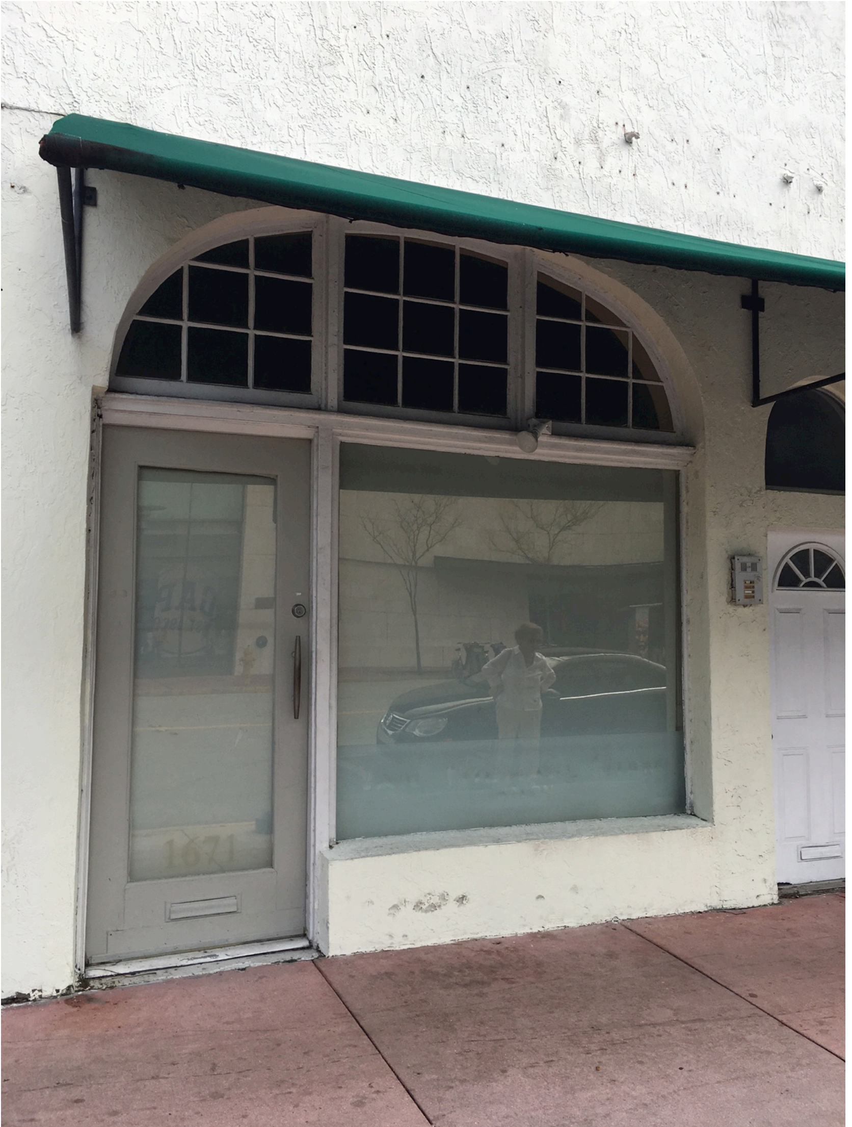
DETAIL AT TYPICAL ORIGINAL STOREFRONT