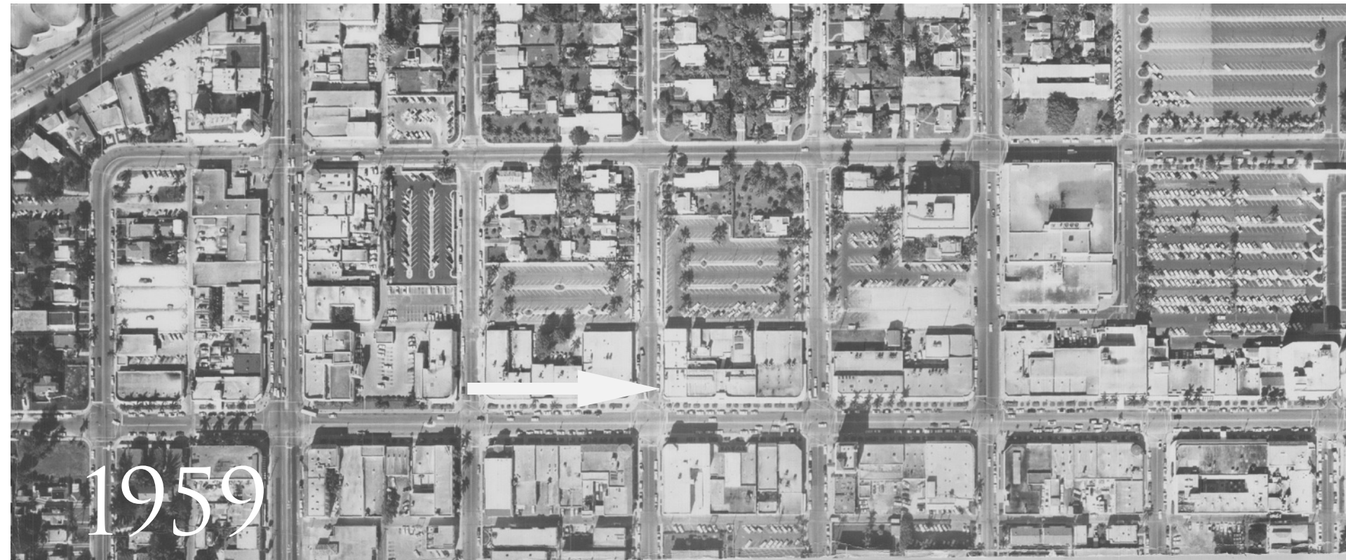
IN THESE AERIAL PHOTOGRAPHS THE EIGHT-SIDEED CUPULA CAN BE CLEARLY SEEN IN THE 1941 AND 1954 PHOTOGRAPHS. HOWEVER IT HAD BEEN REMOVED BY THE TIME OF THE 1959 PHOTO.