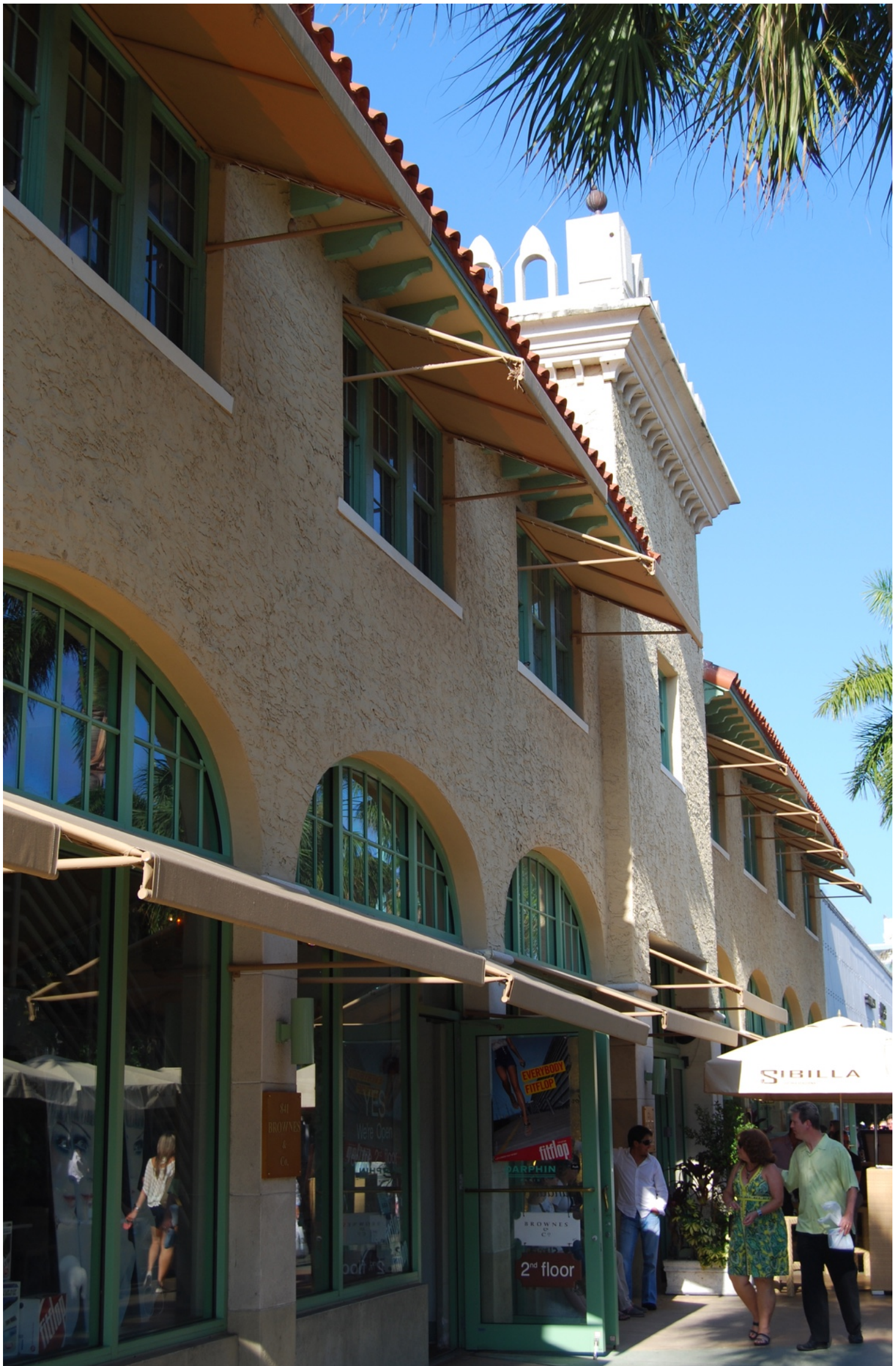
BASTIAN BUILDING at 943 LINCOLN ROAD DESIGNED BY WILLIAM F. BROWN IN 1924 AND RESTORED BY BEILENSON ARCHITECT 2014 PHOTOGRAPH