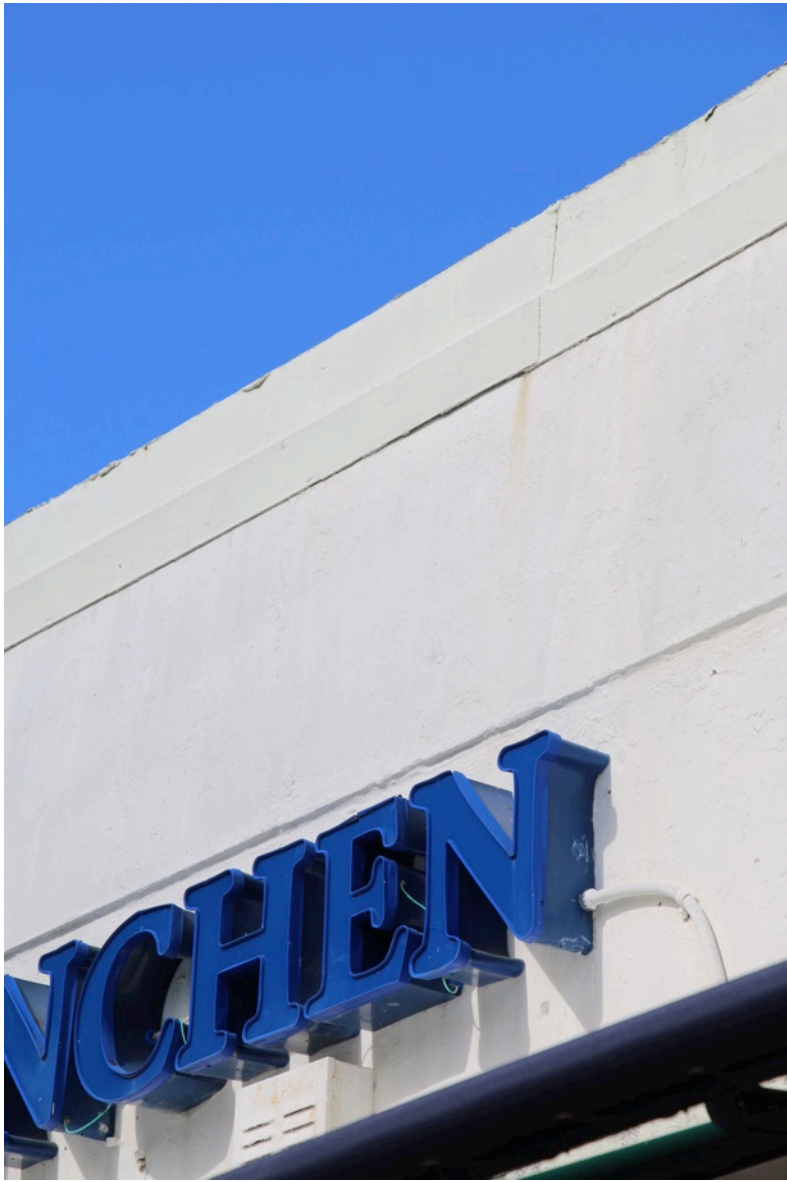
LEFT: DETAIL AT PARAPET

BELOW: DETAIL AT INTERIOR RETAIL STORE CEILING AT FORMER ICEBOX RESTAURANT. THE CEILING LOOKS TO BE COMPOSED OF PECKY CYPRESS WOOD PLANKS, WHICH WAS A TYPICAL INTERIOR CEILING TREATMENT IN MIAMI BEACH IN THE 1920's.