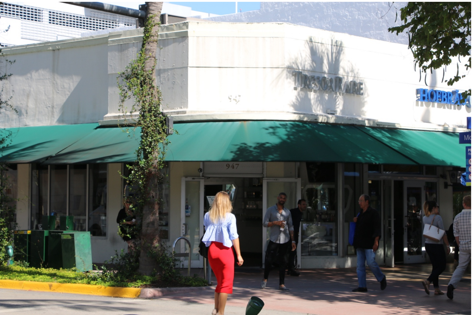
BELOW: 2017 PHOTOGRAPH SHOWS CORNER ENTRANCE WITH DIXON DESIGNED CLADDING WHICH ENDS NOT FAR ONTO MICHIGAN AVENUE