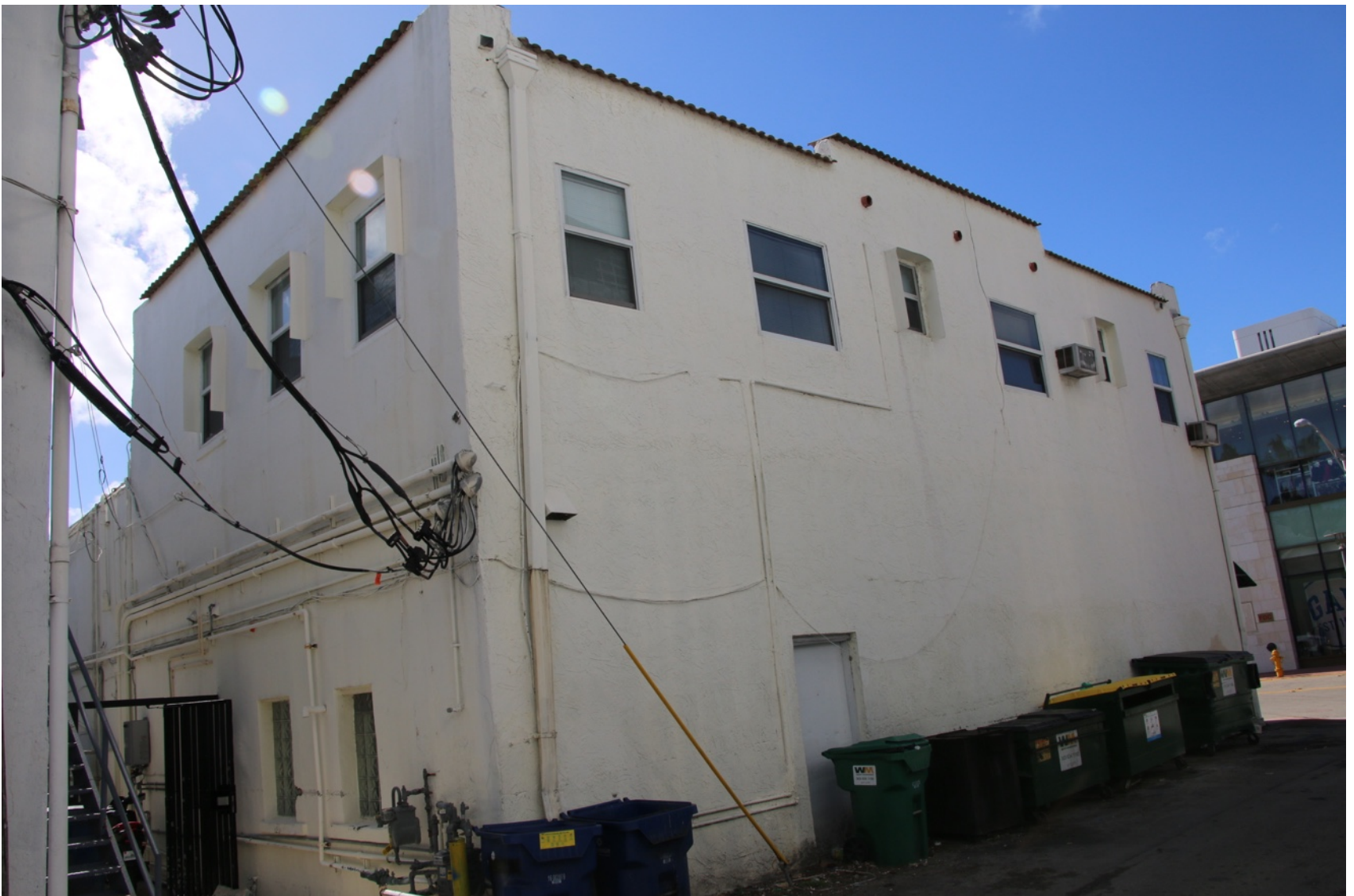
PHOTO BELOW: VIEW OF NORTH ELEVATION AT RIGHT AND EST ELEVATION AT ALLEY AT LEFT.