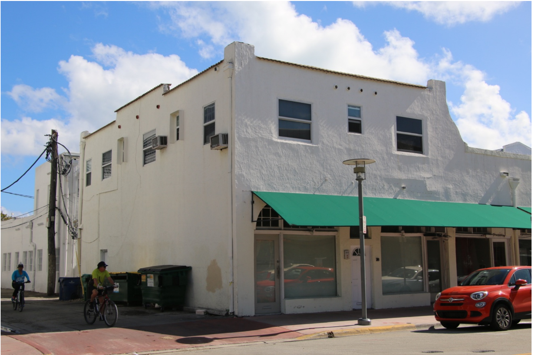
PHOTO ABOVE: VIEW OF WEST ELEVATION AT RIGHT AND NORTH ELEVATION AT LEFT