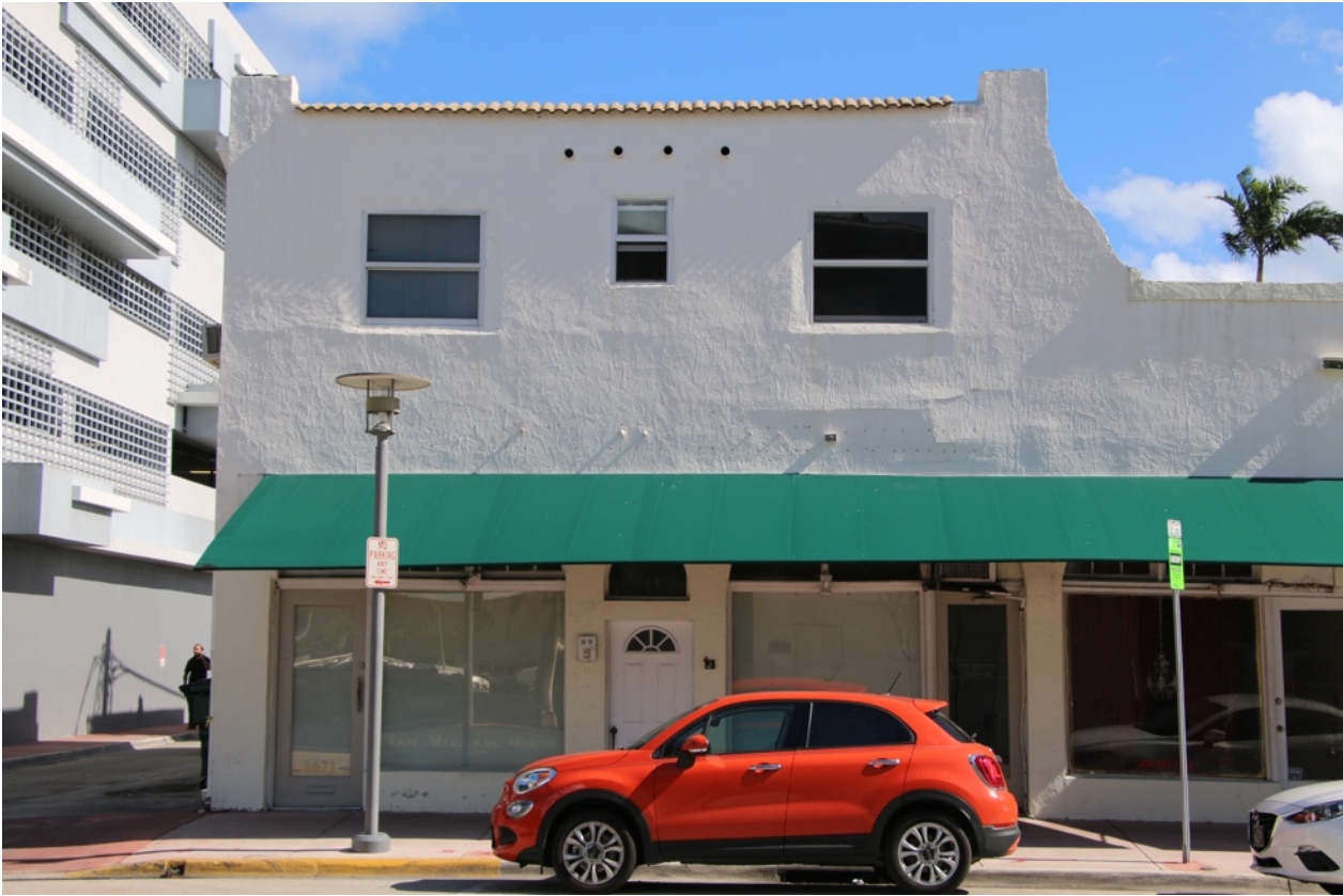
LEFT PHOTO: TWO STORY SECTION AT NORTHERN SIDE OF PROPERTY