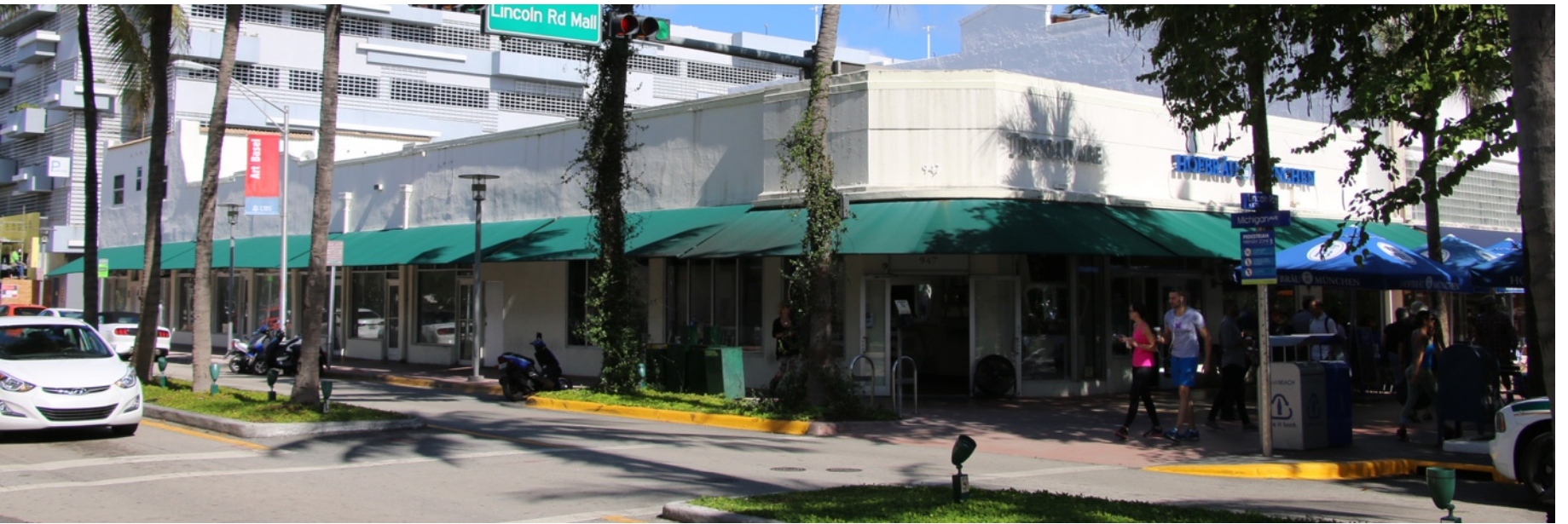
ABOVE: 2017 PHOTOGRAPH WITH SOUTH ELEVATION on LINCOLN ROAD AT RIGHT AND THE WEST ELEVATION (MICHIGAN AVENUE) AT RIGHT.