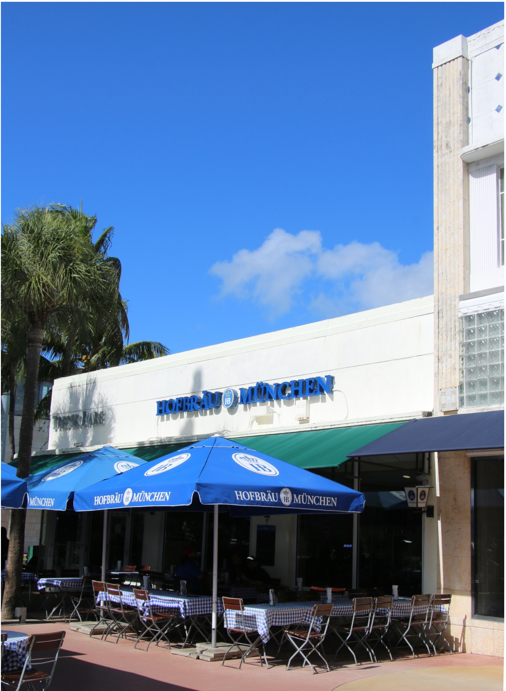
947 LINCOLN ROAD AT LEFT WITH NEIGHBORING STERLING BUILDING AT RIGHT