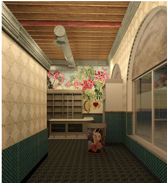
(F) PROPOSED RESTAURANT NOT TO SCALE