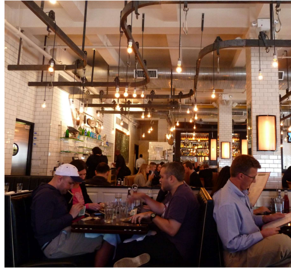
(B) EXISTING RESTAURANT NOT TO SCALE