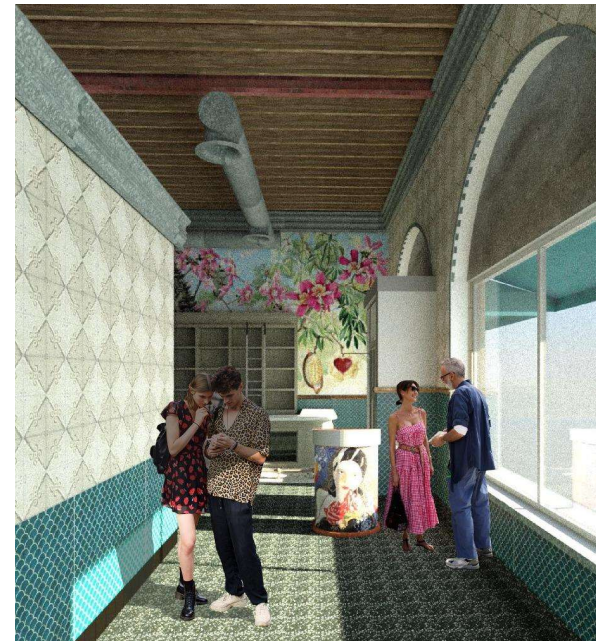
(D) PROPOSED RESTAURANT NOT TO SCALE