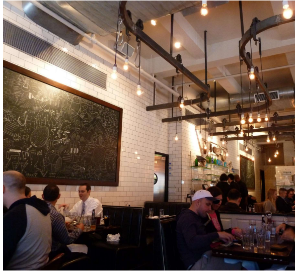
(C) EXISTING RESTAURANT NOT TO SCALE