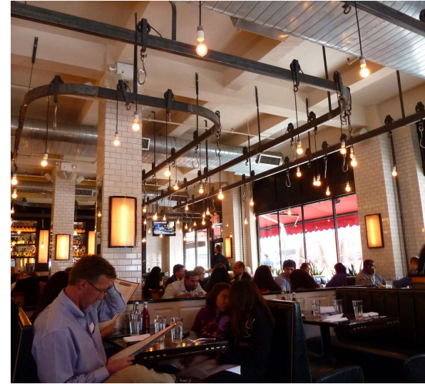
(A) EXISTING RESTAURANT NOT TO SCALE