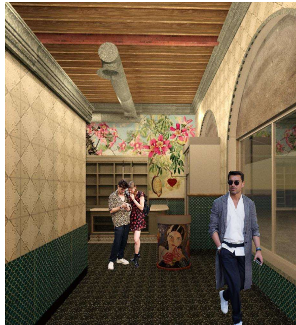
(E) PROPOSED RESTAURANT NOT TO SCALE