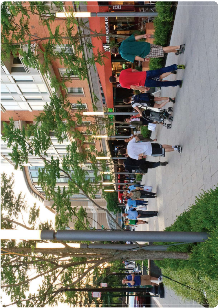
The Avenue, Washington D.C.