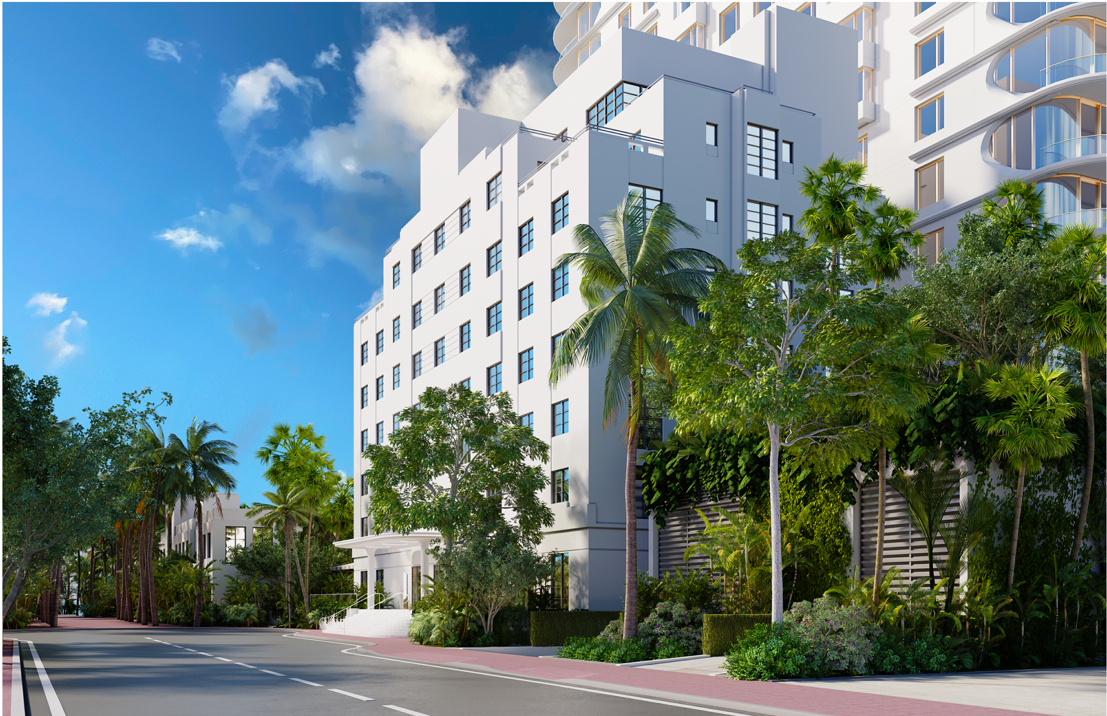
RENDERED ELEVATION PRESENTED TO HPB STAFF