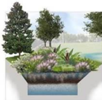
Typical bioretention cross-section with surface depression, Florida-friendly plants, engineered soil, and gravel layer