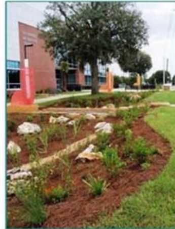
Bioretention facility at the University of Florida Southwest Recreation Center