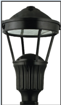
Five (5) Luminaire Models proposed