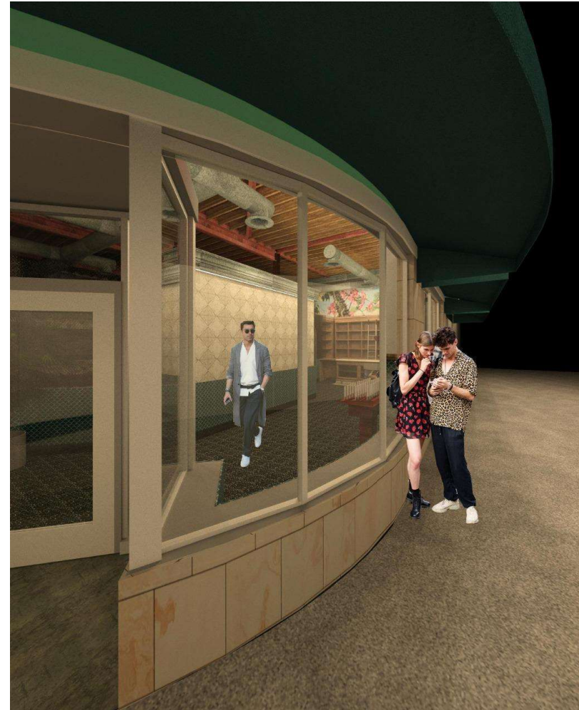
A DREXEL AVENUE - EXTERIOR RENDERING NOT TO SCALE