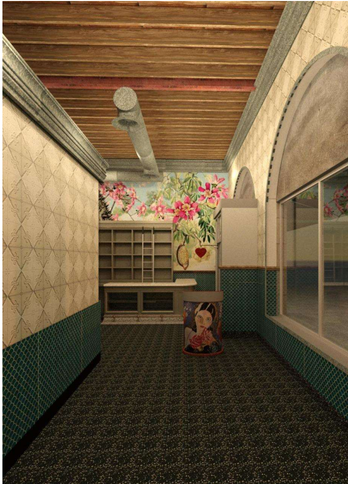
B WAITING AREA - INTERIOR RENDERING NOT TO SCALE