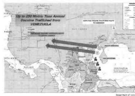
Estimates by the U.S. Department of Justice say the annual volume of drugs passing through Venezuela by 2020 was around 220 tons.

"The maritime shipments were shipped north from Venezuela's coastline using go-fast vessels, fishing boats, and container ships. Air shipments were often dispatched from clandestine airstrips, typ-