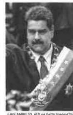
Venezuelan President Nicolas Maduro