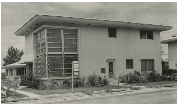
8430 Byron Avenue, 1952 photograph