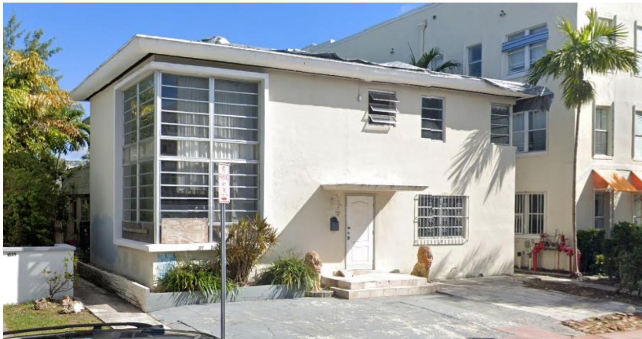
1525 Lenox Avenue, 2022 photograph

In 1964, a small 1-story rooftop addition was constructed to the east of the existing second floor portion of the building. More recently, as noted in the Background section of this report, a number