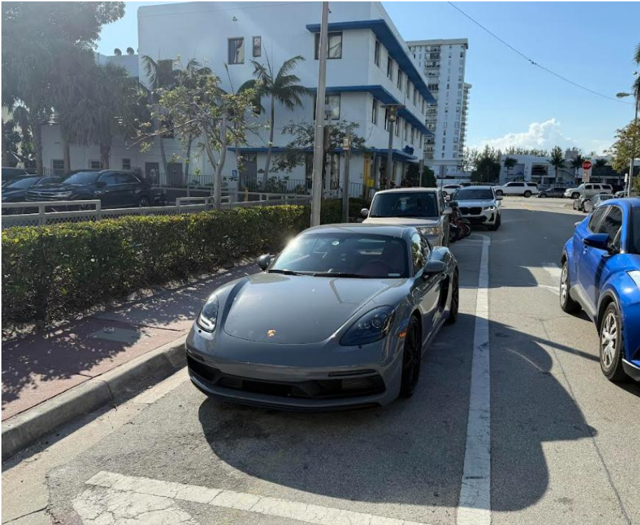
Mid-Beach | Location 1: Collins Ave & 43rd Street (West of Collins) in 2 Parking Spaces