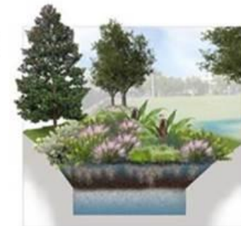
Typical bioretention cross-section with surface depression, Florida-friendly plants, engineered soil, and gravel layer