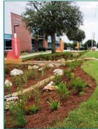
Bioretention facility at the University of Florida Southwest Recreation Center