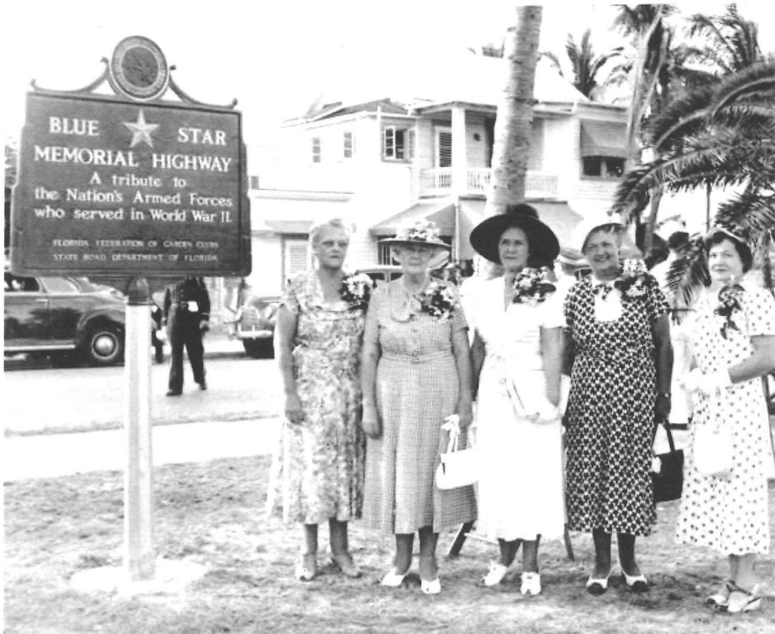
Picture of the Key West Garden Club Board Members and Florida Federation of Garden Clubs President at the dedication of the first Florida Blue Star Memorial Highway Marker at the terminus of US Highway 1 at Bay View Park in Key West. Dedicated on Memorial Day, May 30th of 1949. The plaque served as a Memorial Marker for 31 years at this location before it was gifted to the Miami Beach Garden Club.