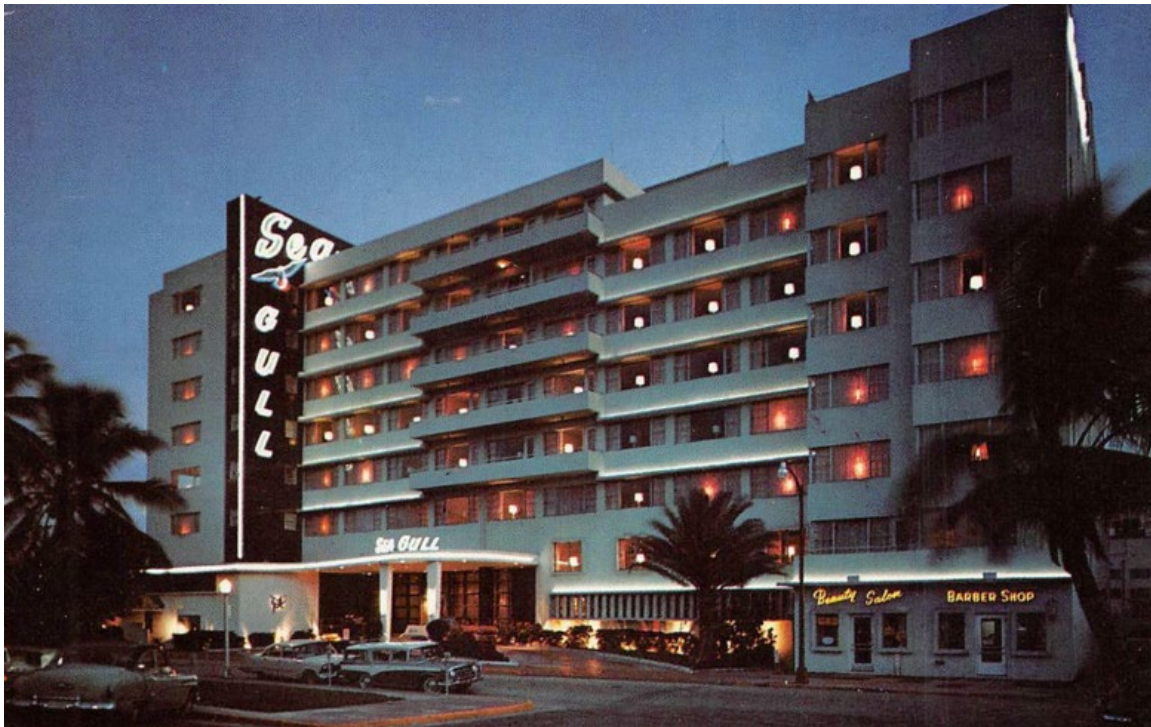
Postcard, postmarked 1956