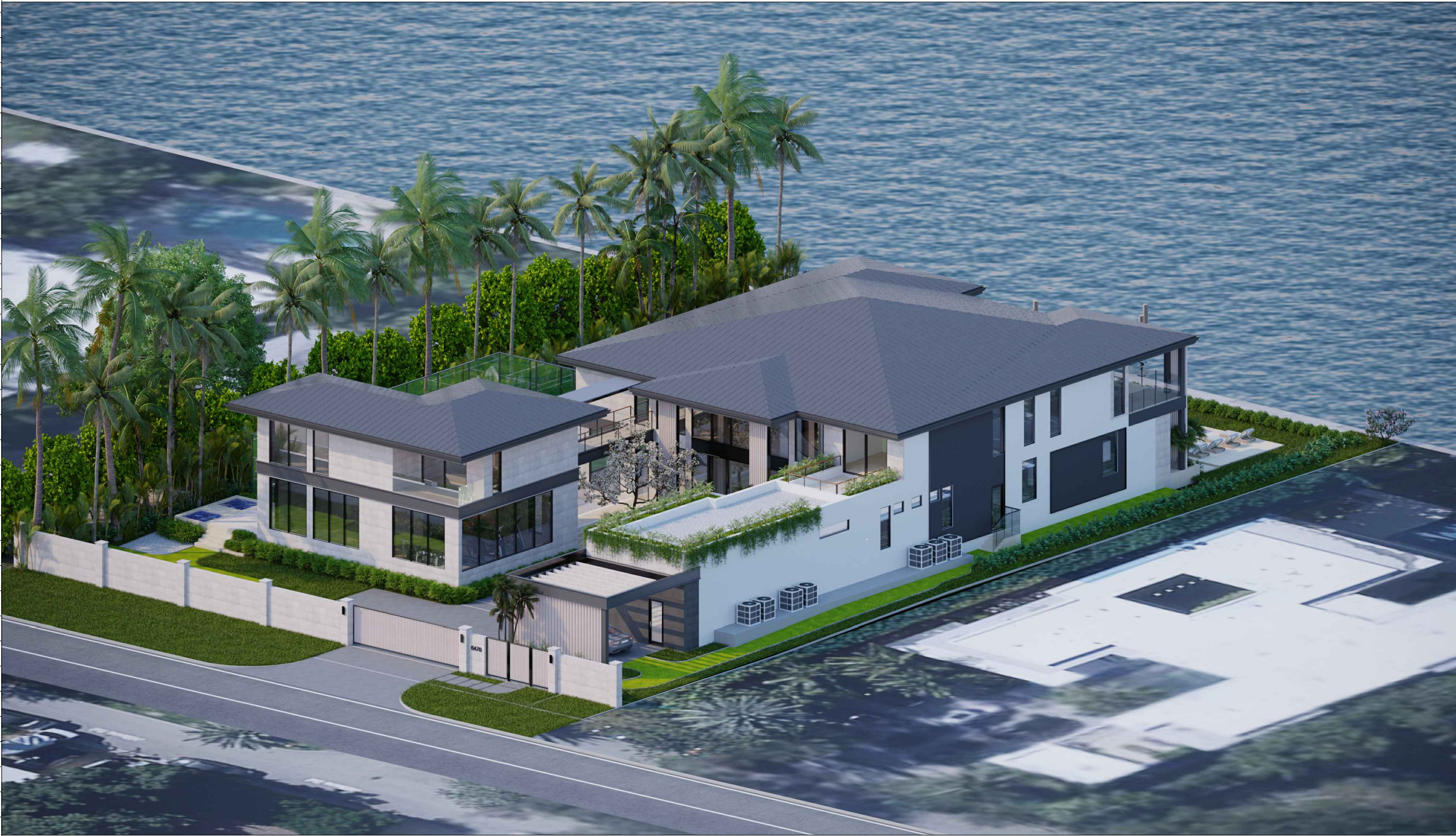
1 NE AXONOMETRIC NO SCALE