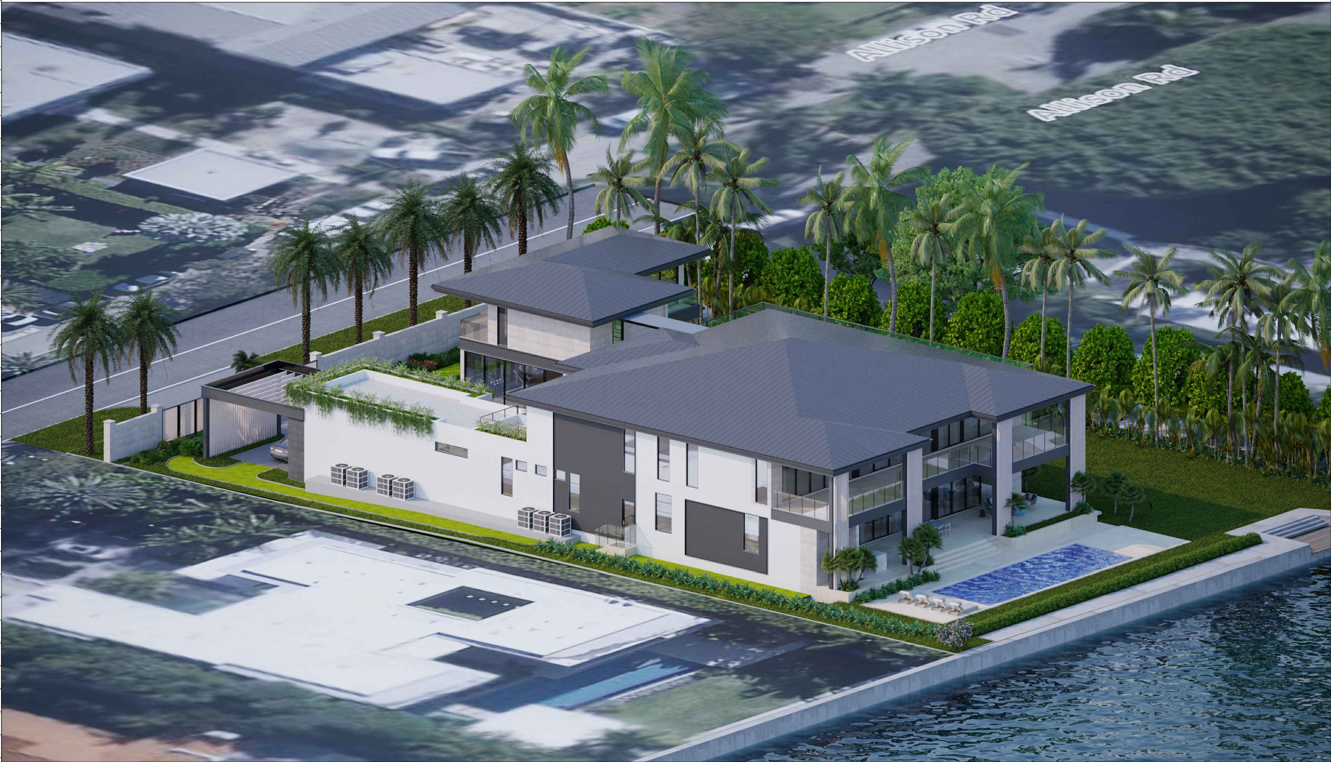
1 NW AXONOMETRIC NO SCALE