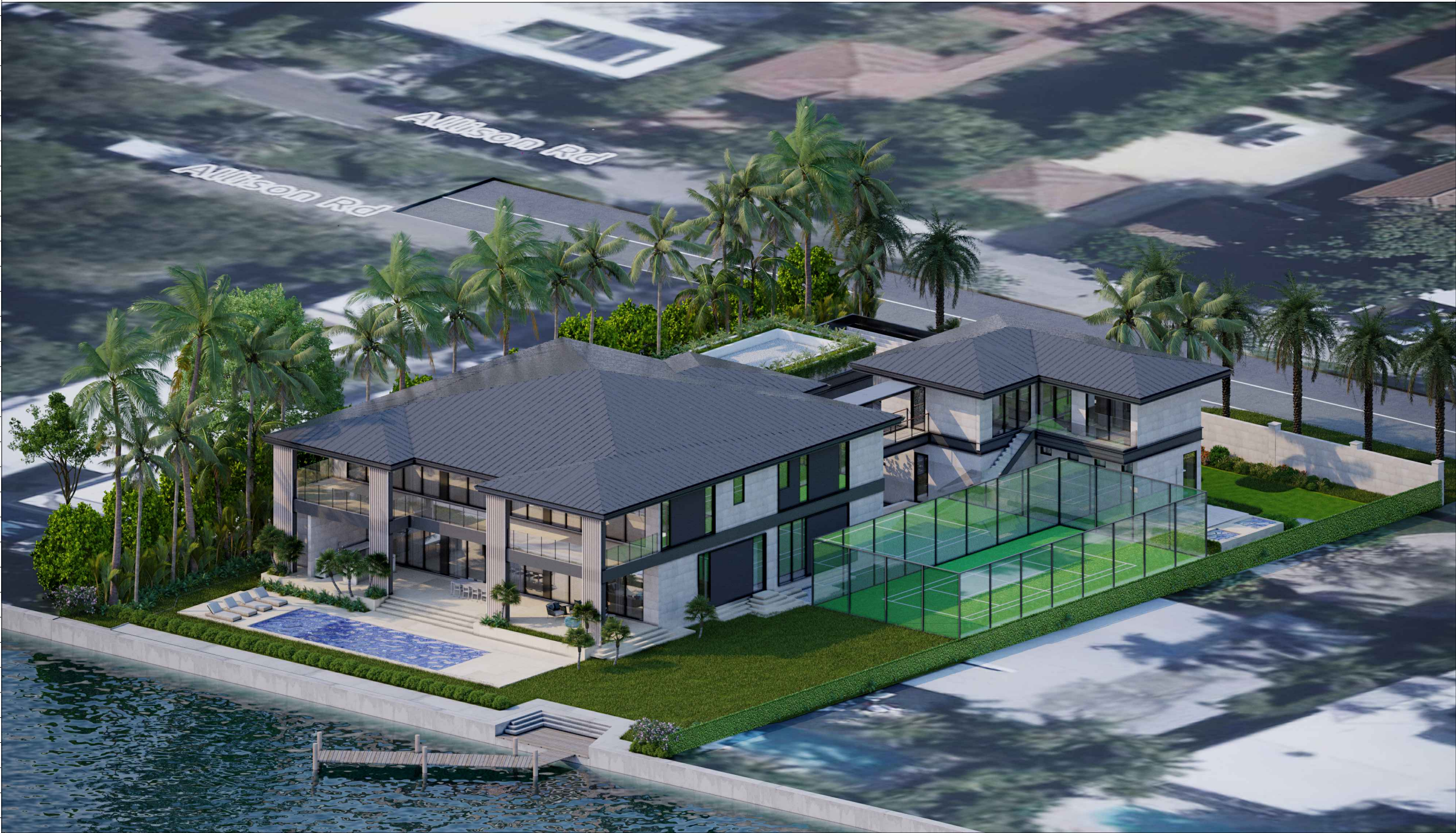
1 SW AXONOMETRIC NO SCALE