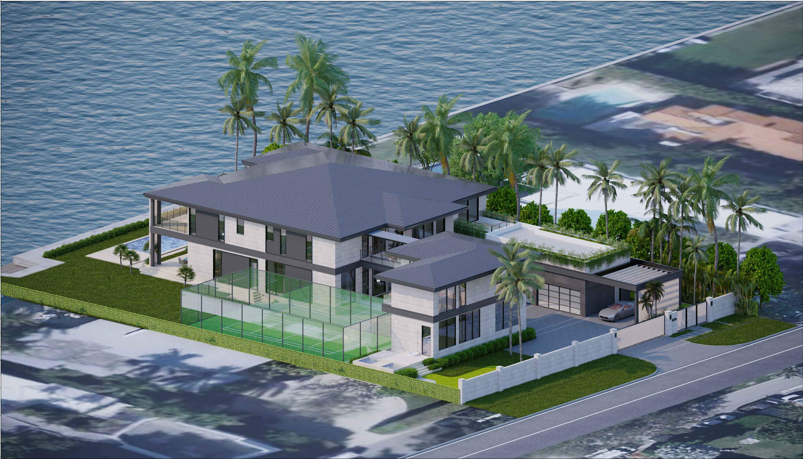
1 SE AXONOMETRIC NO SCALE