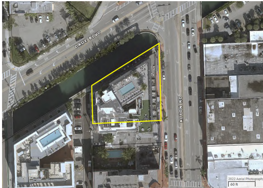
Figure 1, Aerial

CUP Modification. The Property contains a modest, boutique hotel with ninety-six (96) guest rooms, ground floor restaurant space, and active rooftop with pool. In 2015, the Applicant obtained Conditional Use Permit ("CUP"), File No. 2279, to permit construction greater than 50,000 square feet and mechanical parking. The Applicant also obtained Design Review Board approval, File No. 23213, for the design of the new hotel. In 2020, the hotel was constructed consistent with the Planning Board and Design Review Board approvals pursuant to Building Permit No. BC1703462.