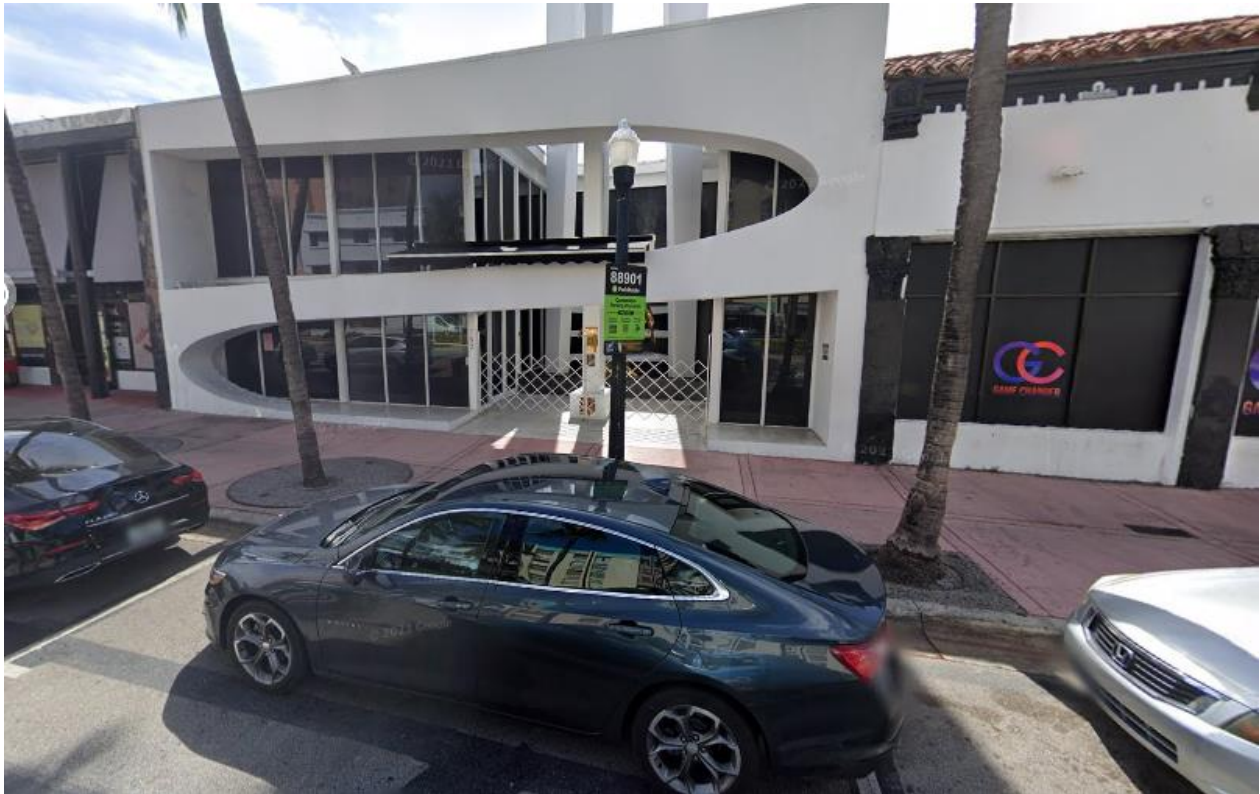
Vendome Nightclub 743 Washington Avenue, Miami Beach, FL 33139